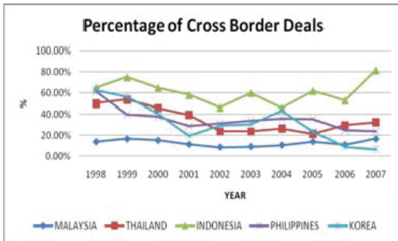
Figure 4 Percentage of cross-border deals.

The Asian economic crisis of the late 1990s forced a wave of unprecedented restructuring of CBMA activities especially in Indonesia, Korea and the Philippines as shown in Figure 4. Malaysia had the lowest CBMA percentage compared to others, while Indonesia recorded the highest among the five countries. This could be due to the relatively complicated and lengthy administrative processes that involve several regulatory bodies in Malaysia (Wong and Partner, 2005; Song, 2007). In Indonesia, privatisation initiatives, and further restructuring or sales of assets formerly purchased from the Indonesian Bank Restructuring Agency