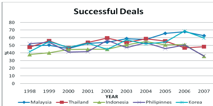
Figure 3 Percentage of successful deals.

to the equity market being under developed and political and social unrest leading to difficulty in the pricing of assets.